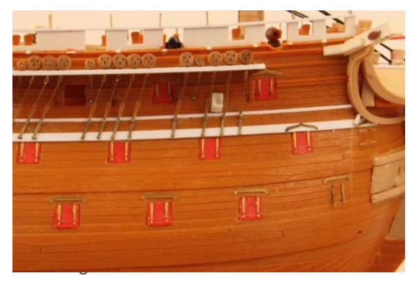
Pictures showing an alternate version with build bulkwards on poop and forecastle and no entrance port.